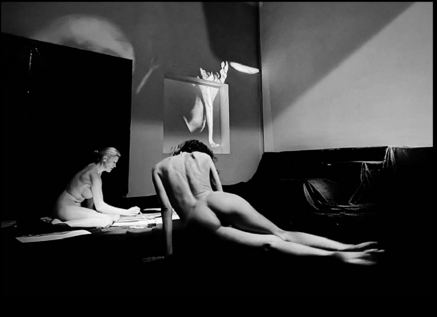
Becoming-Space in Munich, March, 2023