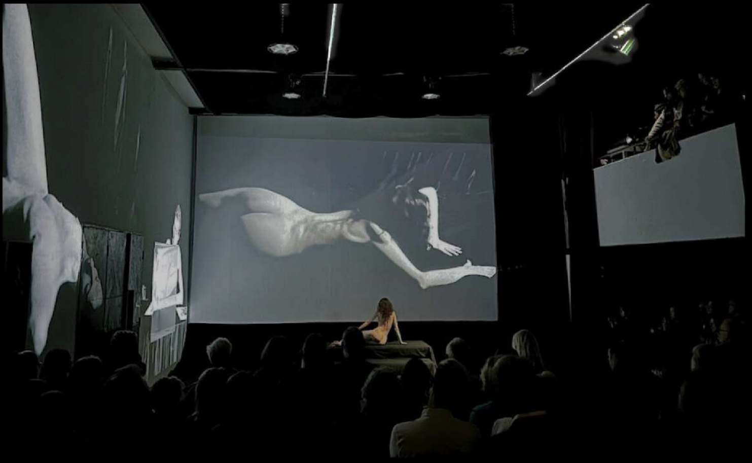
Becoming-Space in Munich, March, 2023