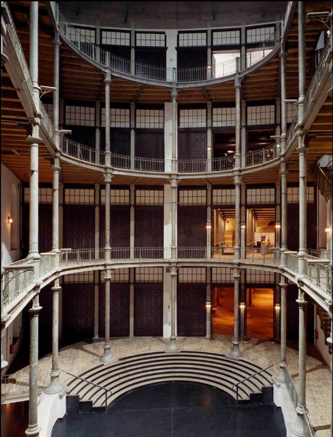
Semperdepot Vienna, Austria. 1874 Performance space