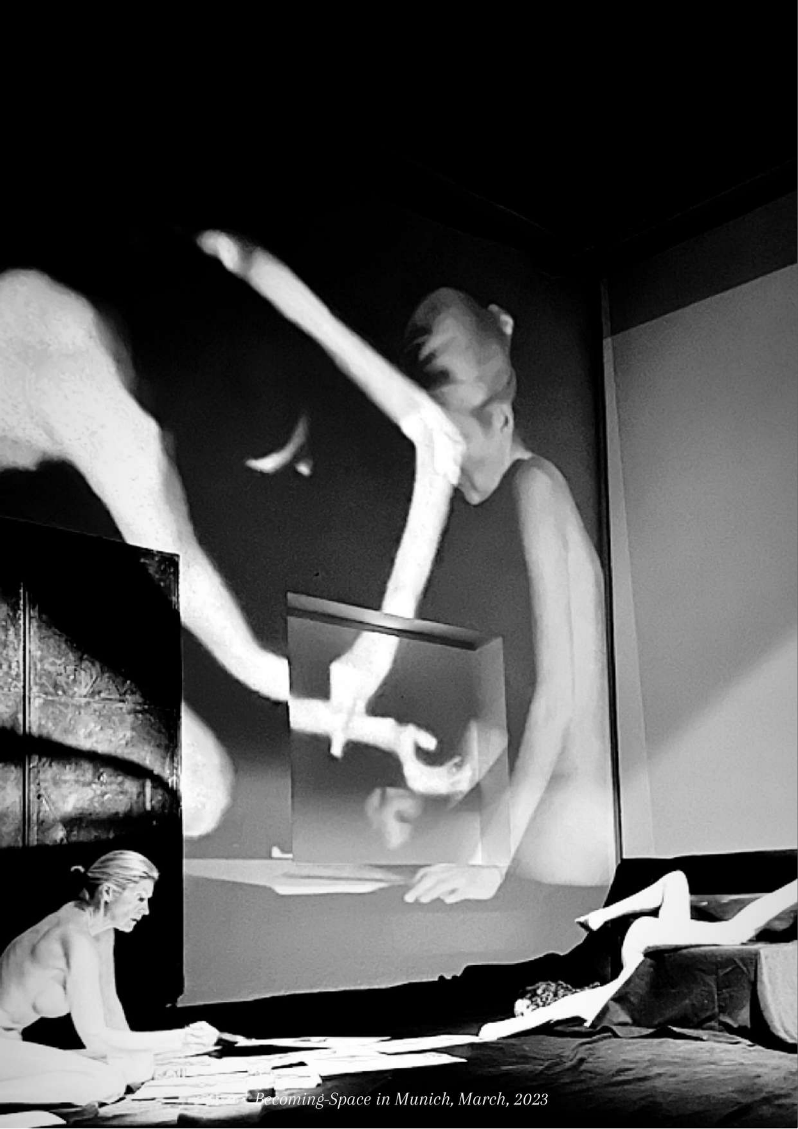
Becoming-Space in Munich, March, 2023