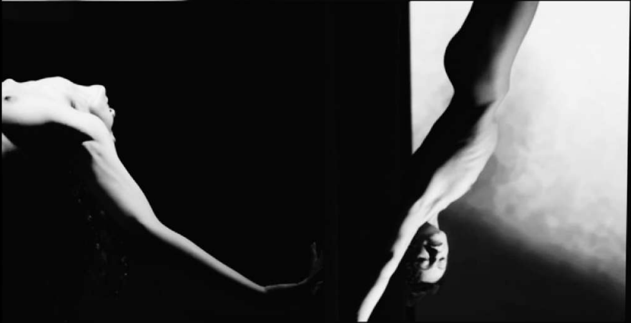
Becoming-Space in Munich, March, 2023